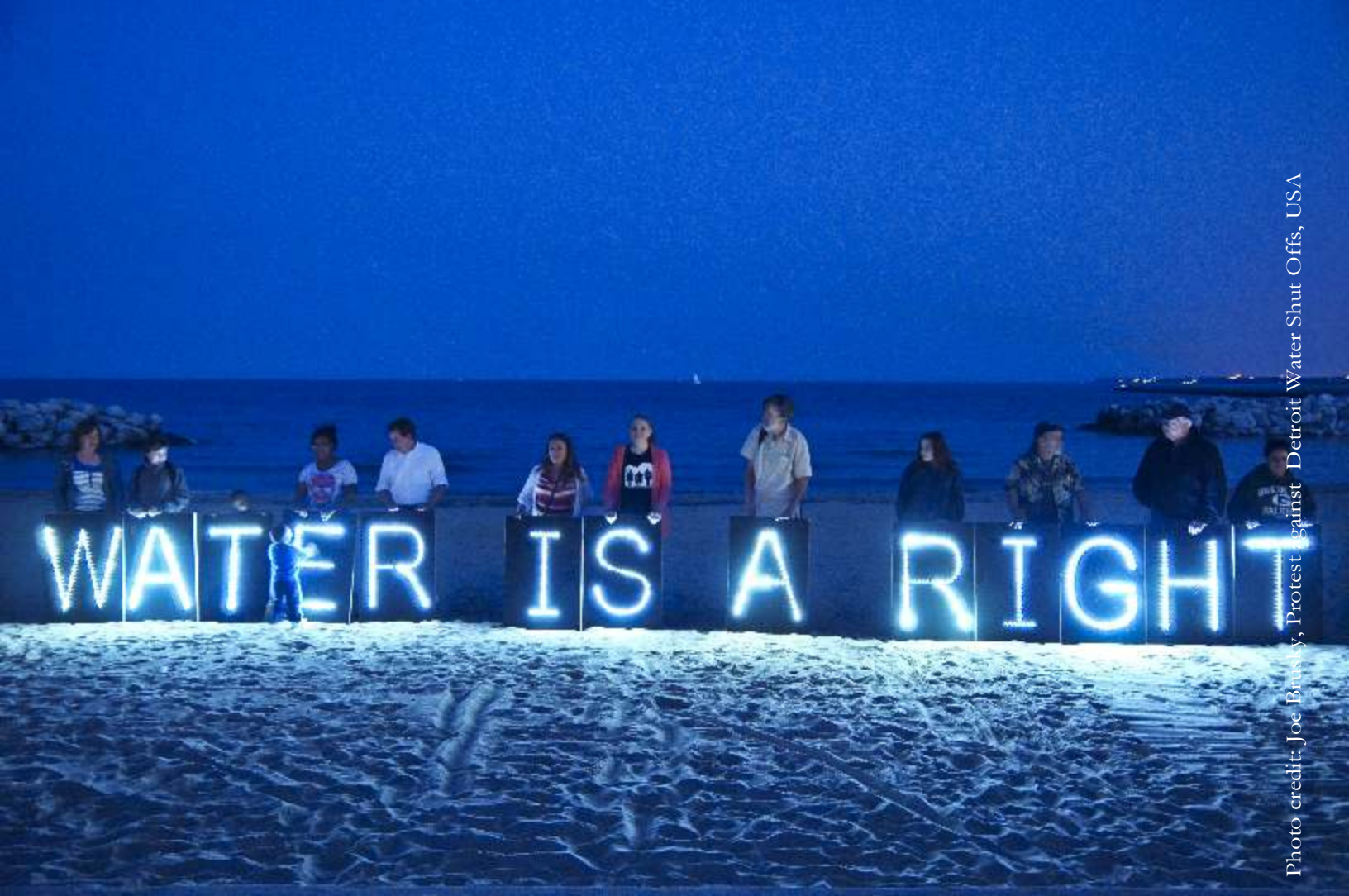
Protest against Detroit Water Shut Offs, USA