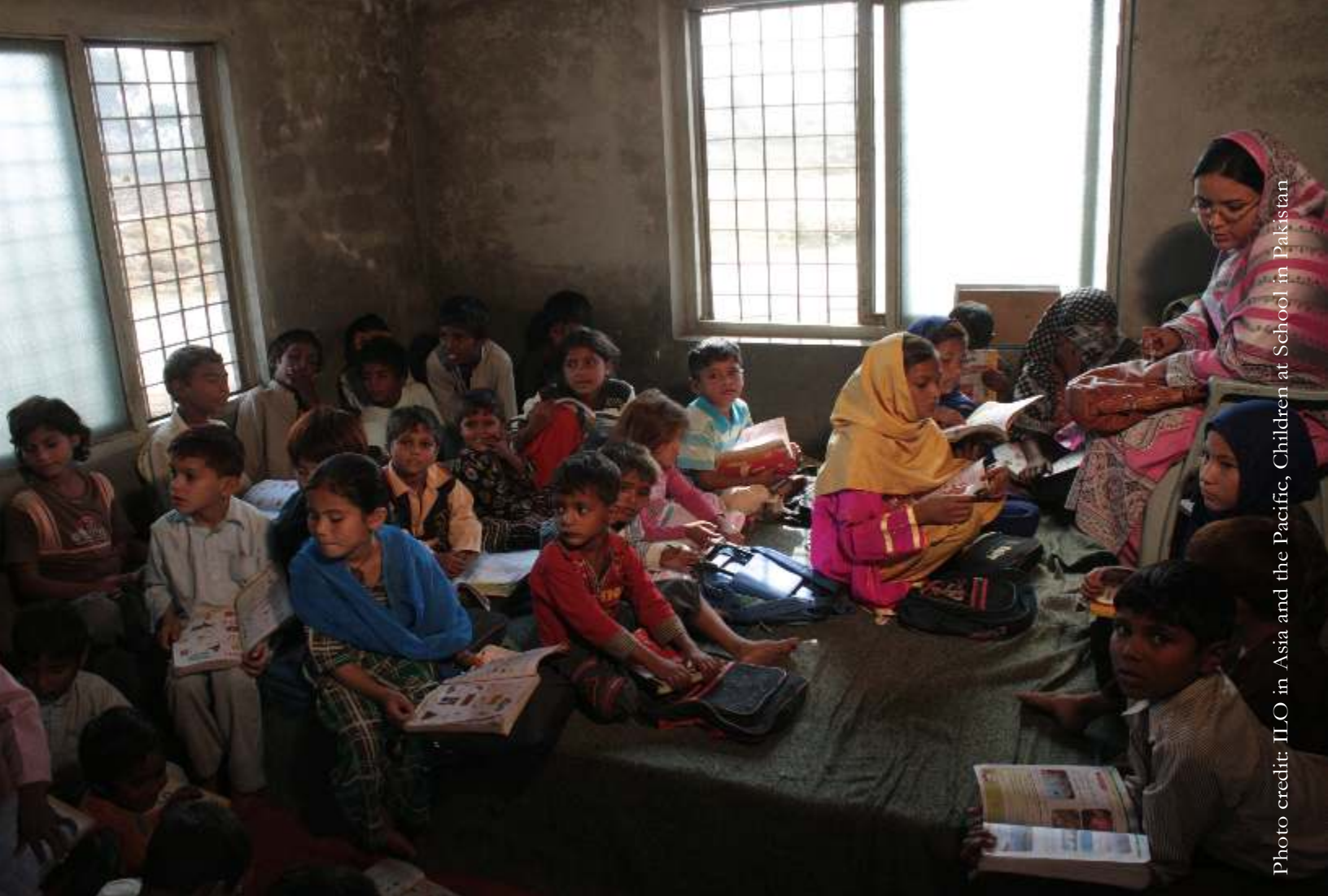
Children at School in Pakistan