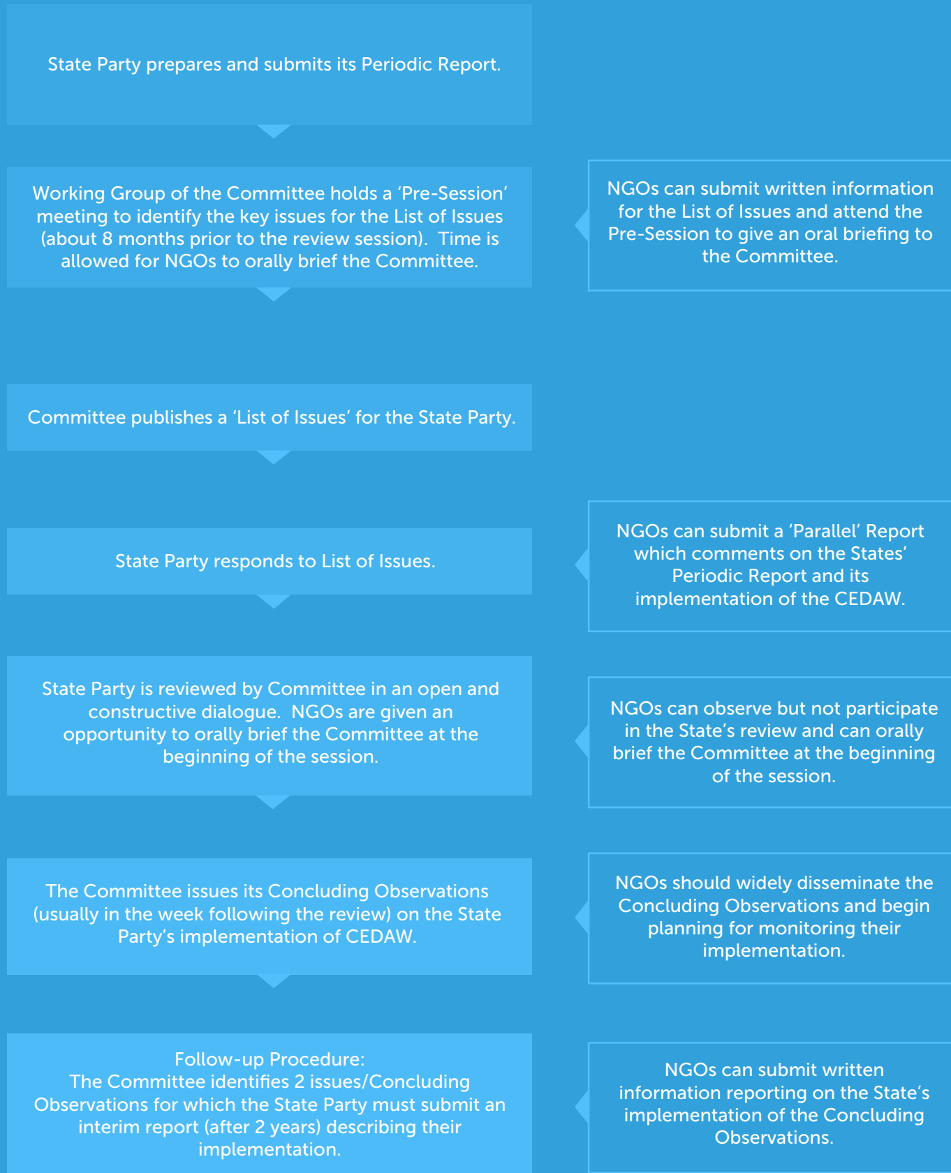
Figure 1. State Party Reporting Process and Opportunities for NGO Intervention